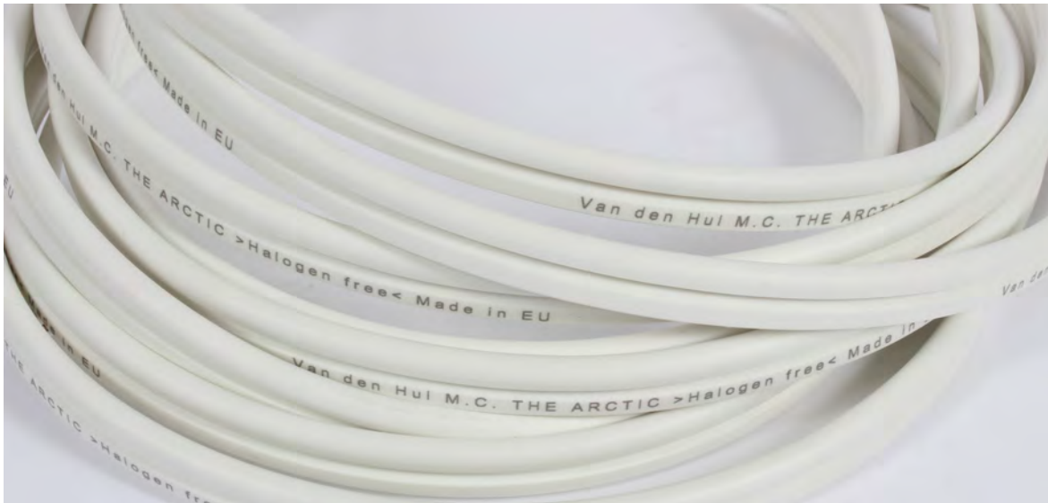
The Arctic > Halogen Free < Made in E.U.