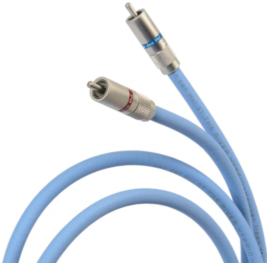
3T The River Hybrid > Halogen Free < Made in E.U.