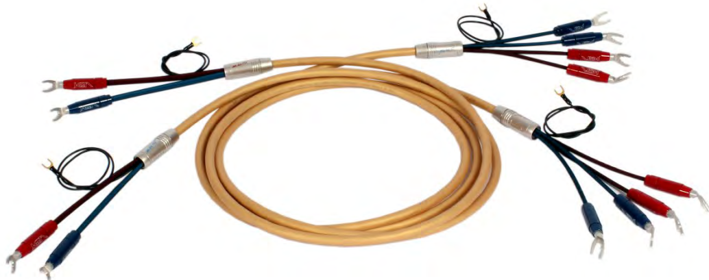
3T The Air > Halogen Free < Made in E.U.