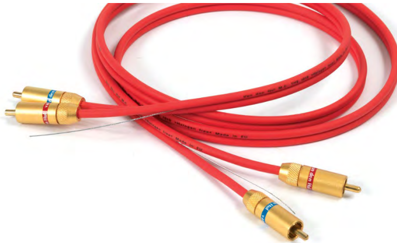
The Isis > Halogen Free < Made in E.U.