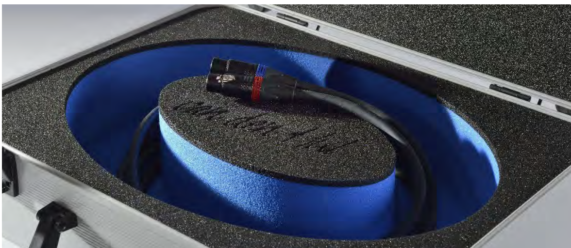
The CNT > Halogen Free < Made in E.U.