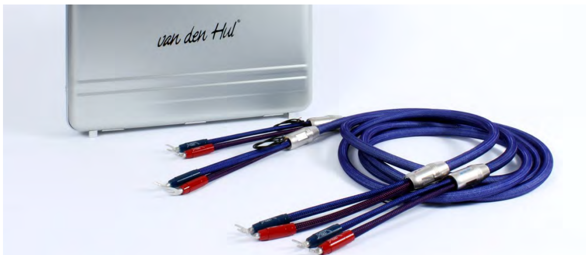
3T The Cloud Limited Edition