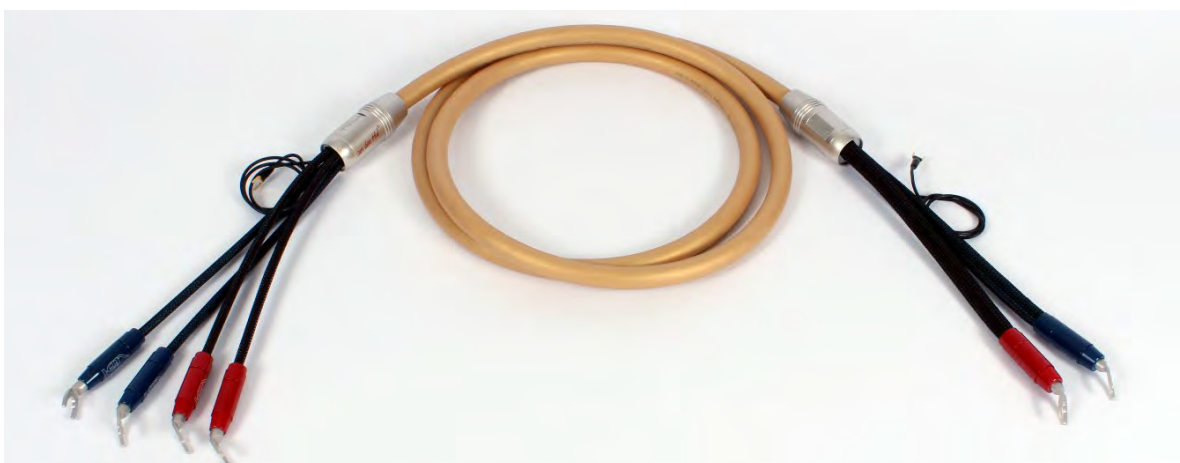
Mounted set 3T The Cloud SE > Halogen Free < Made in E.U.