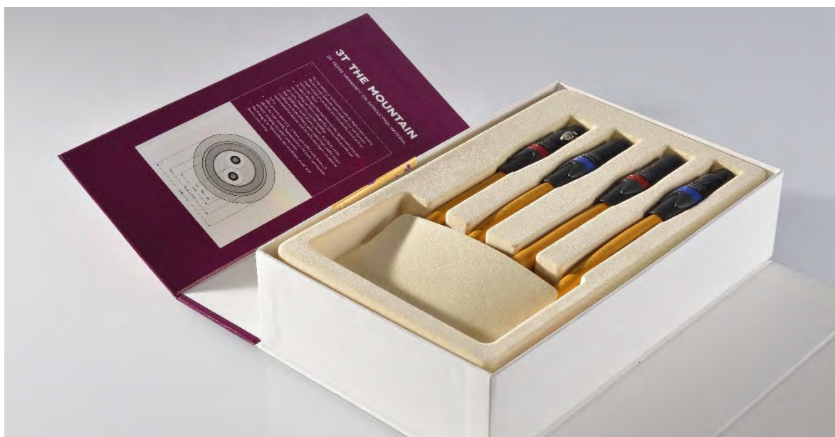
3T The Mountain Hybrid > Halogen Free < Made in E.U.