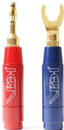
BERRI Bus 8.3mm with spade and BERRI Bus 8.3mm with banana