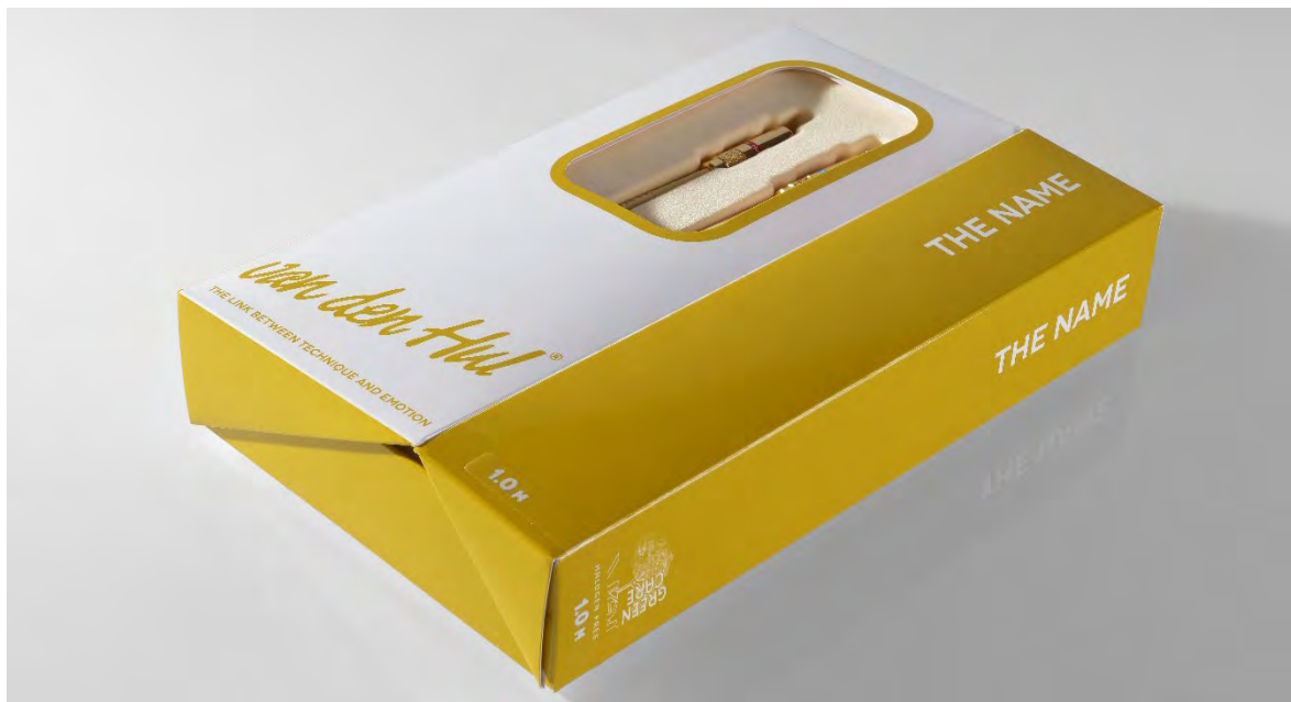
The Name > Halogen Free < Made in E.U.