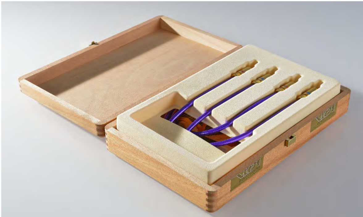
The MC Silver IT 65G > PVC Free < Made in E.U.