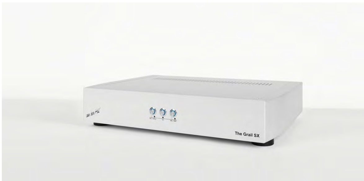
The Grail SX Amp

With this product, you are the owner of one of the most innovative and advanced phonograph preamplifiers available at the moment. It delivers fully balanced inputs and outputs. "The Grail SX" is a really dulcet phonograph preamplifier, specifically designed to bear ultimate performance and reliability in mind.