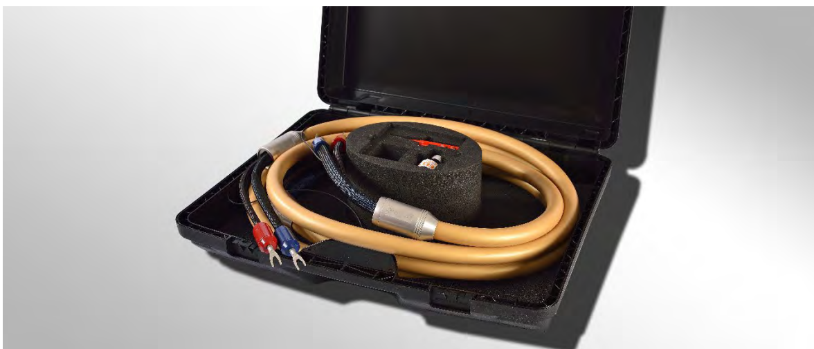
3T The Cumulus Hybrid > Halogen Free < Made in E.U.