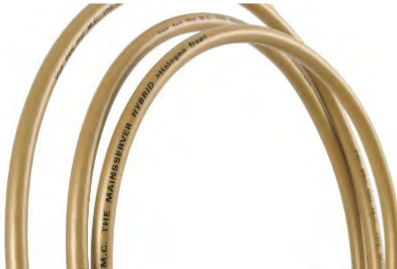
M.C. The Mainsserver Hybrid > Halogen Free < Made in E.U.