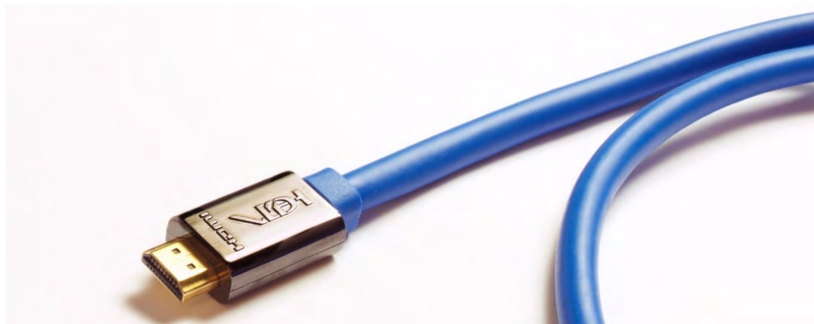
The VDH HDMI Ultimate 4K HEAC > Halogen Free <