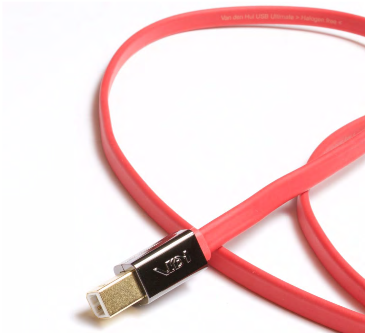
The VDH USB Ultimate > Halogen Free <