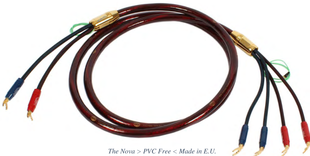
The Nova > PVC Free < Made in E.U.