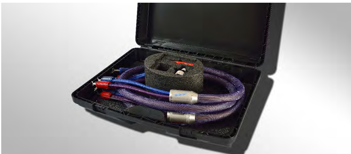
3T The Cumulus Hybrid Limited Edition > Halogen Free < Made in E.U.