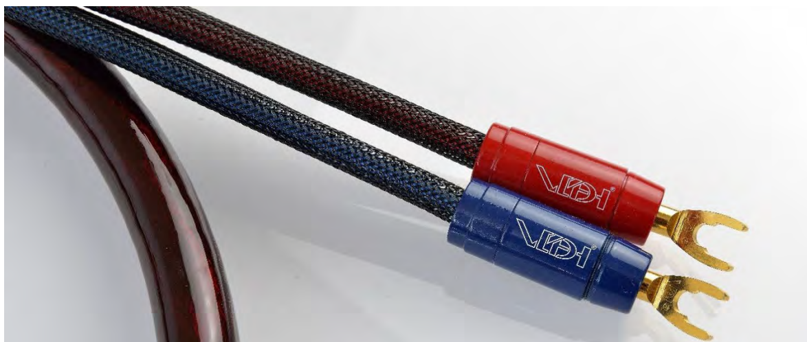
The Super Nova > PVC Free < Made in E.U.