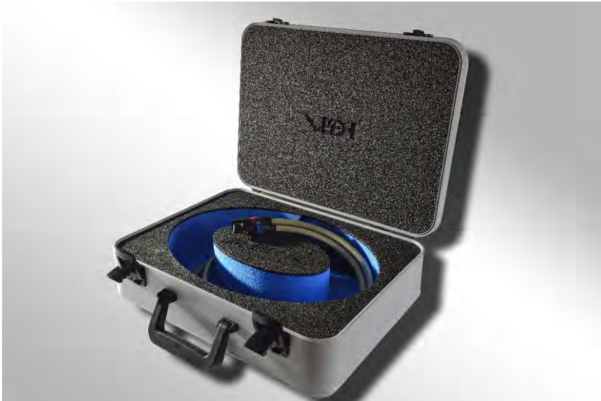
The Platinum Hybrid Mk II Balanced > Halogen Free < Made in E.U.