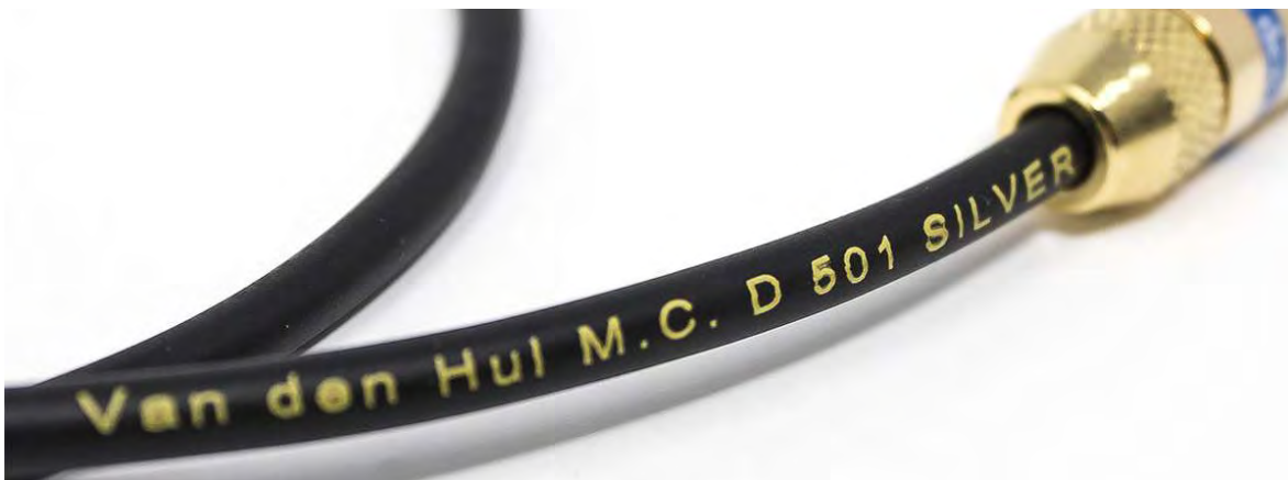
D - 501 Silver Hybrid > Halogen Free < Made in E.U.