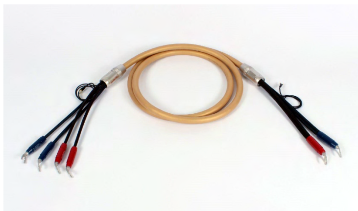
3T The Cloud – Mounted as bi-wiring set with rhodium plated BERRI busconnectors