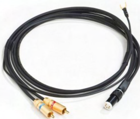
The D- 501 Silver Hybrid, mounted with RCA 4.0 and TAC connectors.