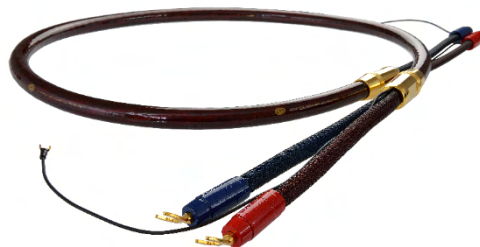
The Super Nova – Mounted as stereo pair with gold plated BERRI busconnectors