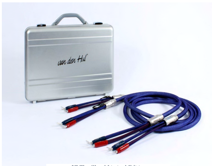
3T The Cloud Limited Edition