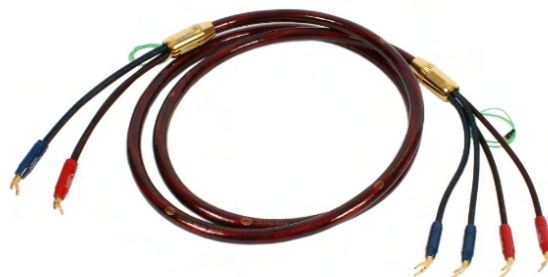
The Nova – Mounted as bi-wiring set with gold plated BERRI busconnectors