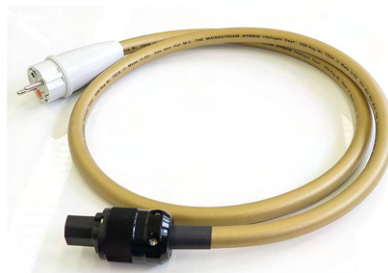
M.C. The Mainsstream Hybrid – mounted with Schuko – IEC connectors.