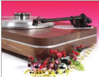
INSPIRE MONARCH turntable EXCLUSIVE!

FREE READER CLASSIFIED ADS IN THIS ISSUE!