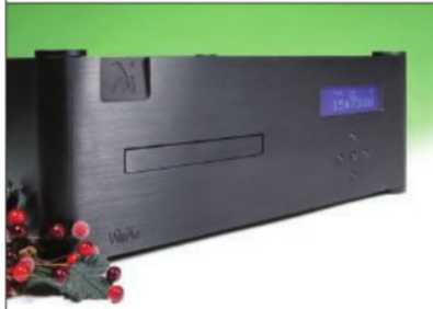
WADIA S7i CD player