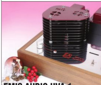
EMIS AUDIO HVA 1 valve amplifier EXCLUSIVE!